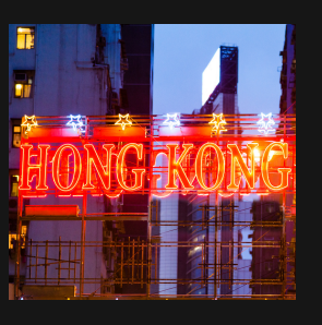
IS HONG KONG FREE OR IN CHAINS?